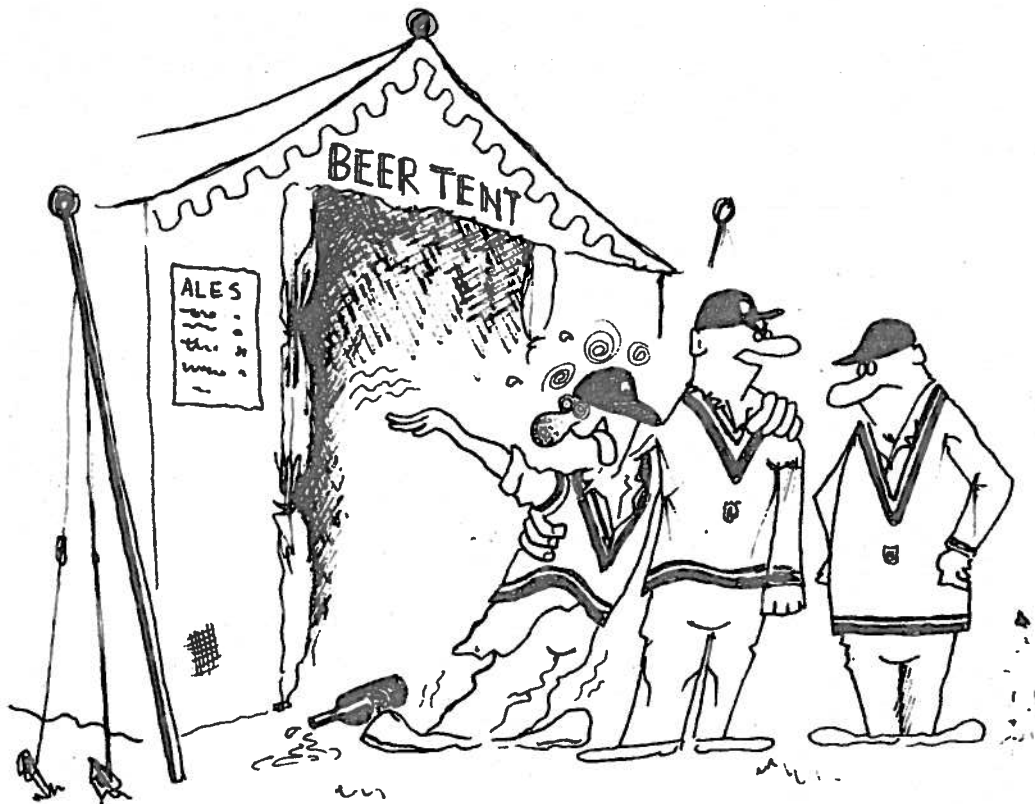
"It's Johnson skipper....been down at deep fine leg all afternoon...."

More of the 35 cartoons in the book in future 'Arkley Herald's'.