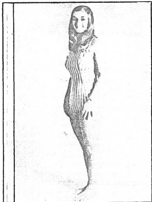
JOANNA DAVIES. 22, Tottenham, London (37-28-37)

THAT'S ALL FOR NOW FOLKS SHORT BUT NONETHELESS NAUSEATING!